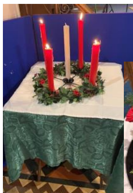
Carols by Candlelight