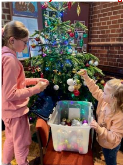
Tree being decorated at the Coffee Community morning at the end of November