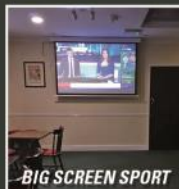
BIG SCREEN SPORT