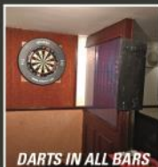
DARTS IN ALL BARS