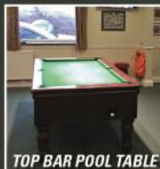
TOP BAR POOL TABLE